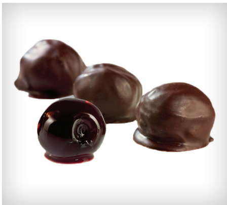
Maglio Amarena Cherry 1KG Loose / 80G Box