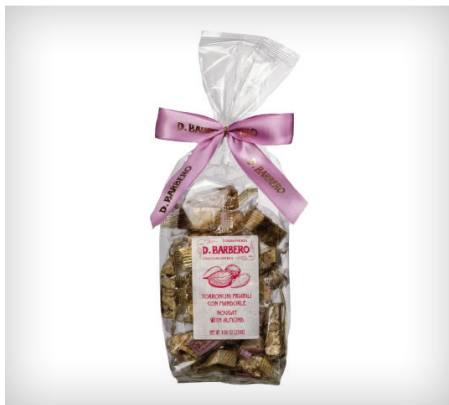
D.Barbero Crumbly Almond Torroncini 200G Bags / 3KG Loose