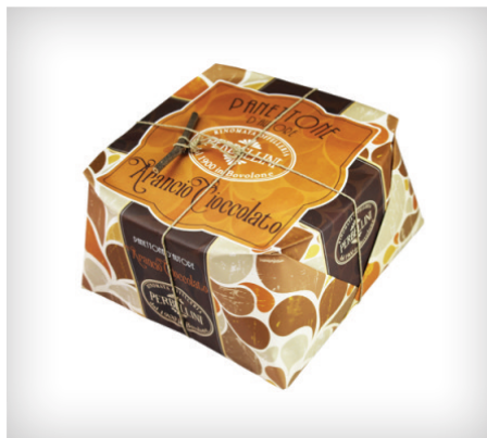
Perbellini Orange and Chocolate Panettone 950G