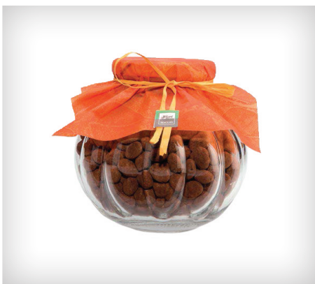
Maglio Tartufini Rachela Almond 2KG Glass Pot / 150G Box / 200G Wood Box