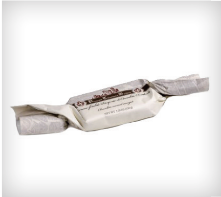
D.Barbero Premiata Chocolate Covered Crumbly Hazelnut Torrone 150G