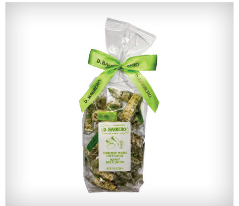
D.Barbero Crumbly Pistachio Torroncini 200G Bags / 3KG Loose