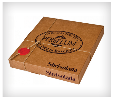
Perbellini Almond Shortbread Biscuit 350G