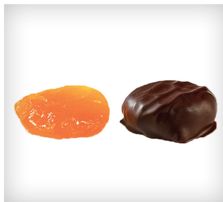
Maglio Apricot 3KG Loose / 65G Box