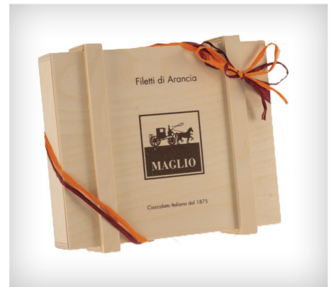
Maglio Orange Peel 200G Wood Box