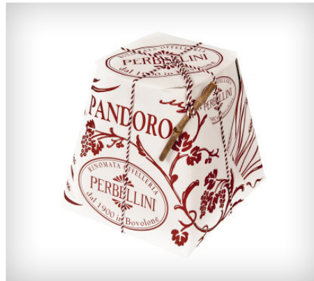
Perbellini Pandoro 850G