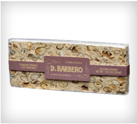
D.Barbero Crumbly Almond Torrone 200G / 300G