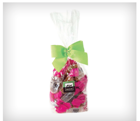
Maglio Assorted Petit Fruit 200G Bag