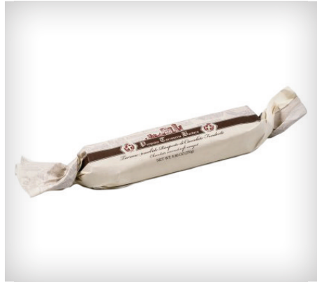
D.Barbero Premiata Chocolate Covered Soft Hazelnut Torrone 250G