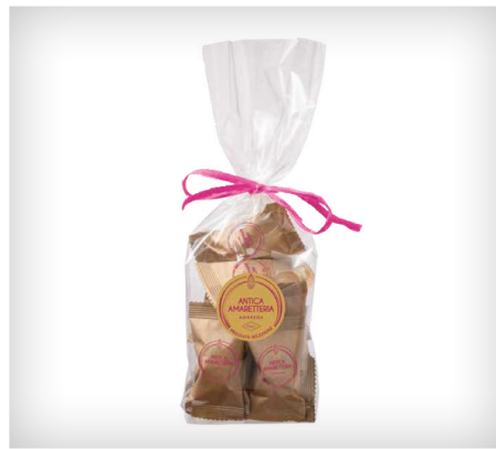
Antica Amaretteria Soft Black Cherry Amaretti 200KG Bag / 3KG Loose