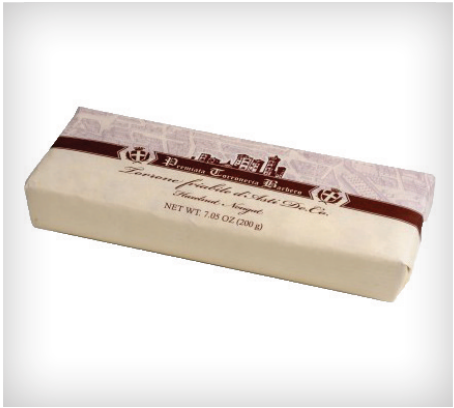
D.Barbero Premiata Crumbly Hazelnut Torrone 200G