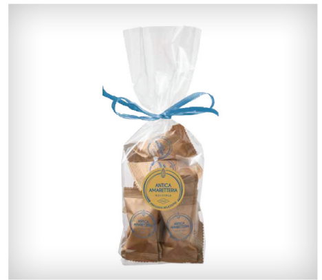
Antica Amaretteria Soft Hazelnut Amaretti 200KG Bag / 3KG Loose