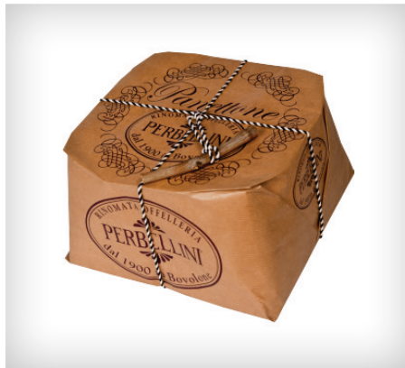
Perbellini Classic Panettone 600G / 950G