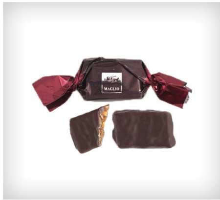
Maglio Almond & Honey Croccatino 3KG Loose