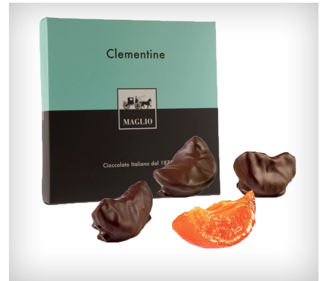
Maglio Clementine 3KG Loose / 65G Box / 170G Box