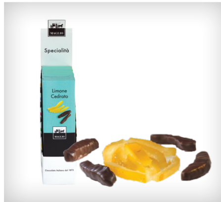
Maglio Lemon Peel 3KG Loose / 75G Bag

Maglio has a history to be proud of. Established in 1850 in the centre of Maglie, in the heart of Salento, this family company has created an extraordinary heritage of confectionery making. Tradition and passion for this work has been passed down through the family, from father to child.