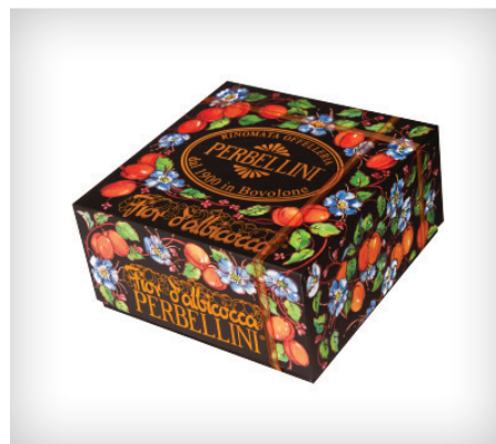
Perbellini Apricot Cake 550G