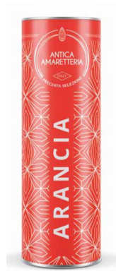
Antica Amaretteria Soft Candied Orange Amaretti 150G Tube