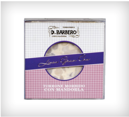
D.Barbero Gran Cru Soft Almond Torrone 100G