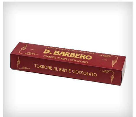
D.Barbero Rum & Chocolate Torrone 270G