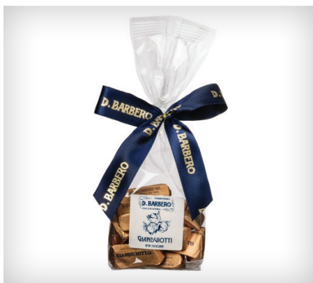
D.Barbero Gianduiotti 200G Bags / 3KG Loose