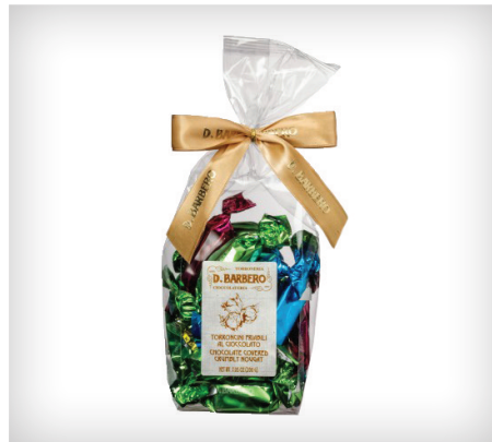
D.Barbero Crumbly Hazelnut Torroncini Chocolate Covered 200G Bags / 3KG Loose