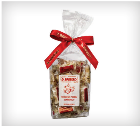
D.Barbero Soft Hazelnut Torroncini 200G Bags / 3KG Loose