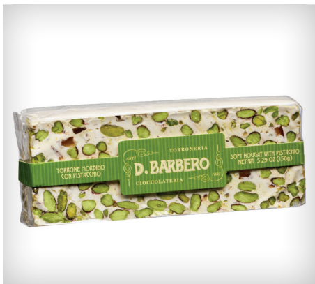
D.Barbero Soft Pistachio Torrone 150G