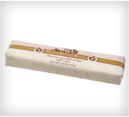
D.Barbero Premiata Soft Hazelnut Torrone 150G