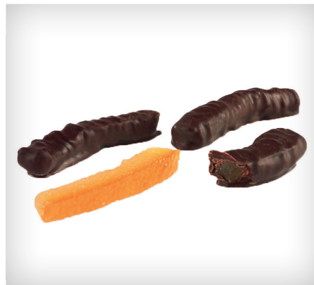
Maglio Orange Peel 3KG Loose / 75G Box / 200G Box