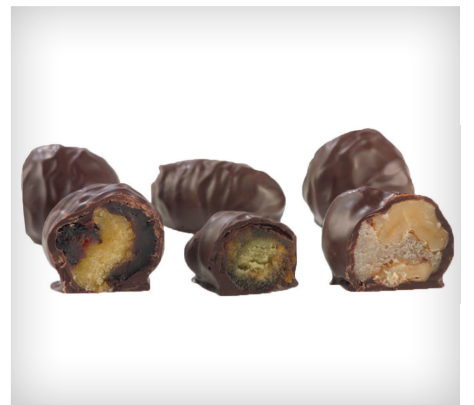
Maglio Plums, Dates & Walnuts 3KG Loose / 90G Box / 350G Box