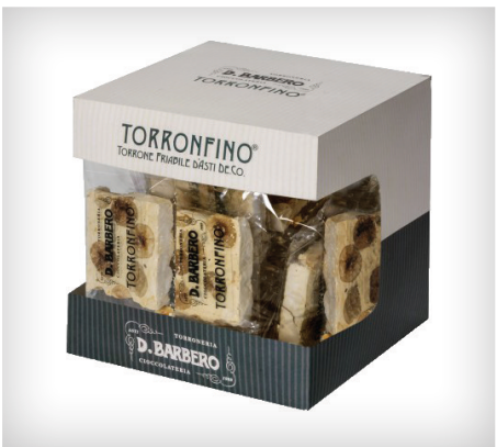
D.Barbero Crumbly Torronfino 130G Display / 3KG Loose