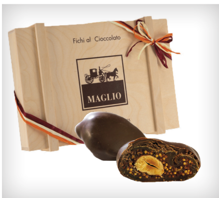
Maglio Fig 400G Wood Box