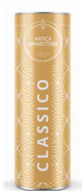
Antica Amaretteria Soft Classic Amaretti 150G Tube