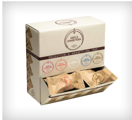
Antica Amaretteria Mixed Soft Amaretti 3KG Display