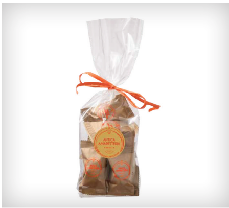
Antica Amaretteria Soft Candied Orange Amaretti 200KG Bag / 3KG Loose