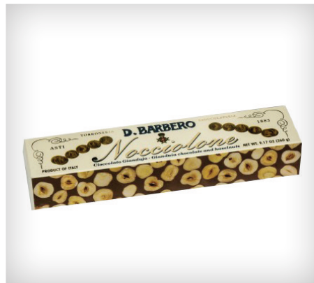
D.Barbero Soft Gianduja Chocolate with Hazelnuts 260G