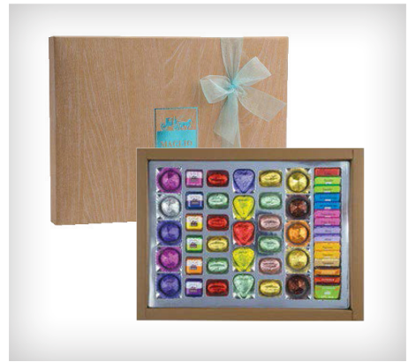
Maglio Assorted Chocolates 600G / 400G / 150G Boxes