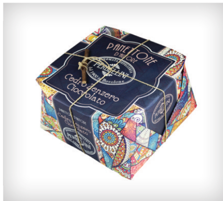
Perbellini Lemon / Ginger / Chocolate Panettone 950G