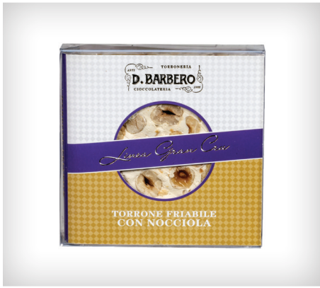
D.Barbero Gran Cru Crumbly Hazelnut Torrone 100G