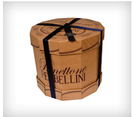
Perbellini Classic Panettone 4KG