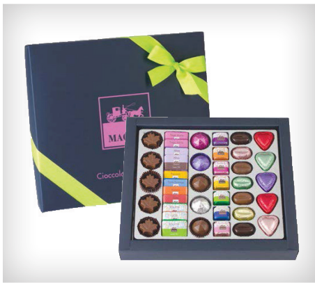
Maglio Assorted Chocolates & Pralines 300G / 230G / 130G Boxes