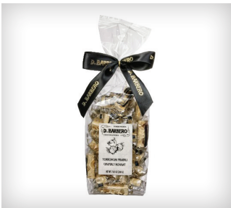
D.Barbero Crumbly Hazelnut Torroncini 200G Bags / 3KG Loose