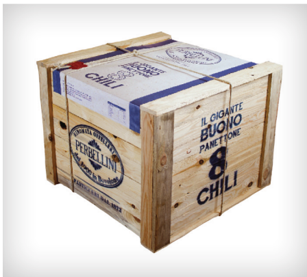
Perbellini Classic Panettone 8KG