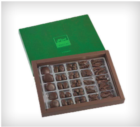
Maglio Assorted Fruits 650G Box