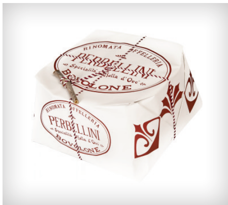
Perbellini Offella d'oro 850G