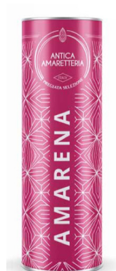
Antica Amaretteria Soft Black Cherry Amaretti 150G Tube