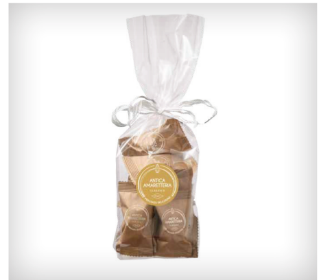
Antica Amaretteria Soft Classic Amaretti 200KG Bag / 3KG Loose