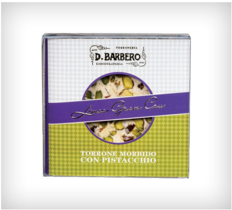
D.Barbero Gran Cru Soft Pistachio Torrone 100G