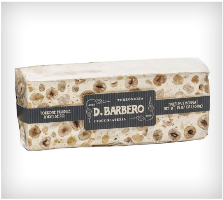
D.Barbero Crumbly Hazelnut Torrone 200G / 300G / 450G / 3KG